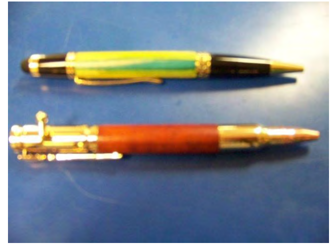
Unique pens by Paul Owen